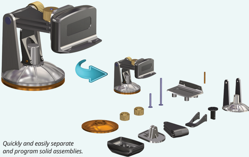
Quickly and easily separate and program solid assemblies.

Whether you bring in a file from an outside CAD package or design one yourself, Mastercam's powerful, easy-to-use CAD engine is included in each main Mastercam product and is also available separately.